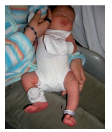
Figure 4.5 Photo of one day old baby wearing RFID tag

There are two basic types of RFID – active and passive. In the active system the object or person whose movements are controlled or monitored carries a radio transmitter. The signal from the transmitter is detected by a fixed receiver mounted on the entry or exit under surveillance. Information from the receiver is then analysed by a computer that sends instructions to permit or prevent passage.