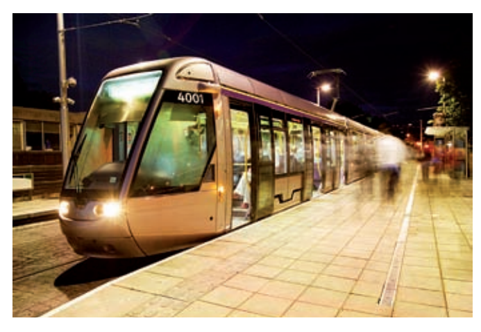
Figure 4.3 Photograph of a LUAS tram in Dublin

At the centre of the earth there is a solid core that is as big as the moon and as hot as the surface of the sun. It provides the heat and energy that melts and drives the surrounding layer of molten iron magma whose movement creates the earth's magnetic field. This natural geomagnetic field varies in strength from 35 to 70 microtesla ( \mu T) and is enough to deflect compass needles, and assist in the navigation and migration of some birds and fish. Static man-made magnetic fields are generated wherever direct (DC) currents are used, as for example in Dublin's DART and LUAS suburban transportation systems, and in a number of industrial processes including aluminium manufacture and gas welding.