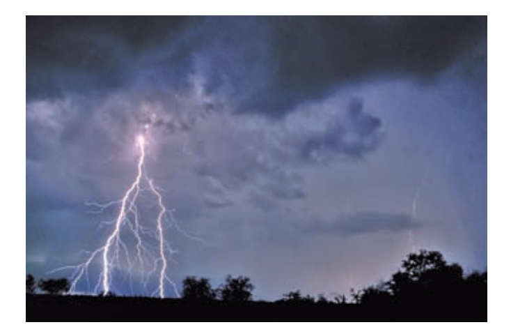
Figure 4.4 Photograph of Lightning

Collisions between cosmic rays and air molecules in the upper atmosphere produce a charged layer of around 300 000 volts some 25 km above the earth's surface. This creates a natural static electric field of around 10 to 100 volts per metre (V/m) at ground level to which we are all exposed. During thunderstorms this field can increase over a hundredfold and the potential for lightning strikes, discharges between the atmosphere and the earth, can pose a serious danger to anyone caught out in the open. Electrostatic fields in a hazardous atmosphere can initiate explosions. A common experience in daily life is the spark discharge experienced when touching something metallic after walking over a carpet. While these electrostatic fields can measure tens of thousands of volts per metre and can be an irritation, they are generally not hazardous because they are not associated with enough electrical charge to cause injury. However such sudden shocks can cause accidents when the affected person falls or drops something they are carrying.